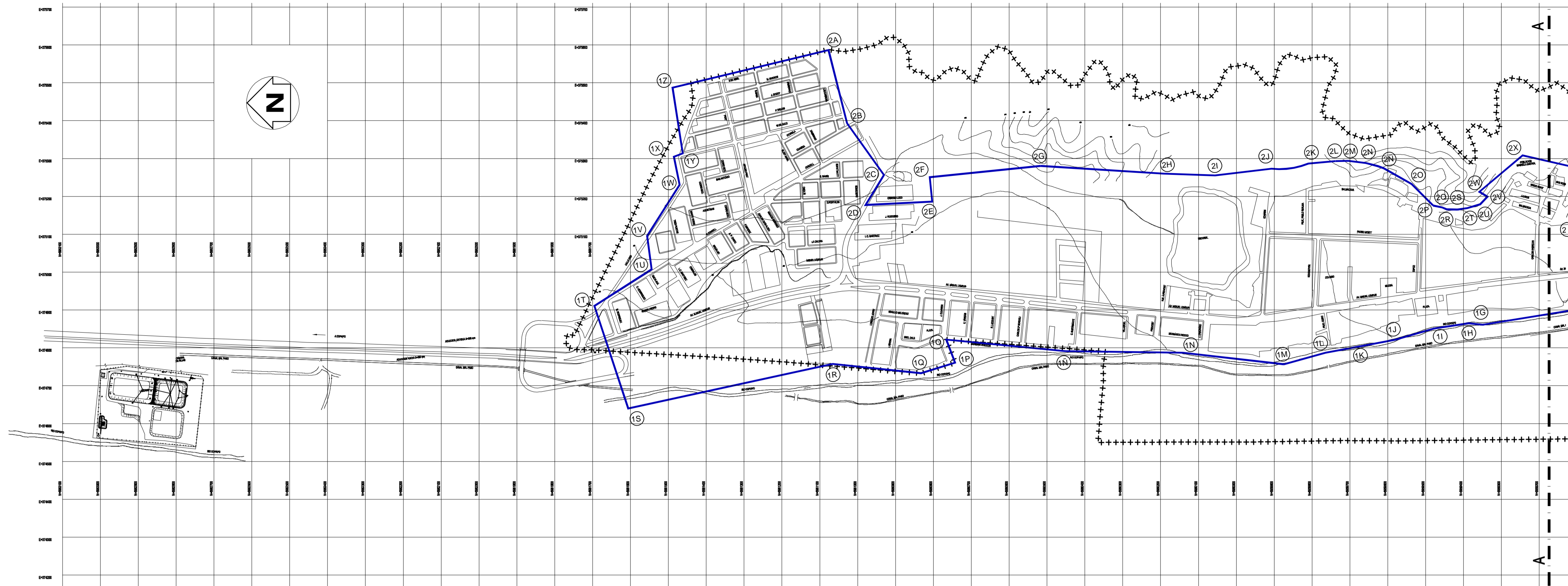
PLANTA GENERAL DE TIERRA AMARILLA TERRITORIO OPERACIONAL ESCALA 1:5000